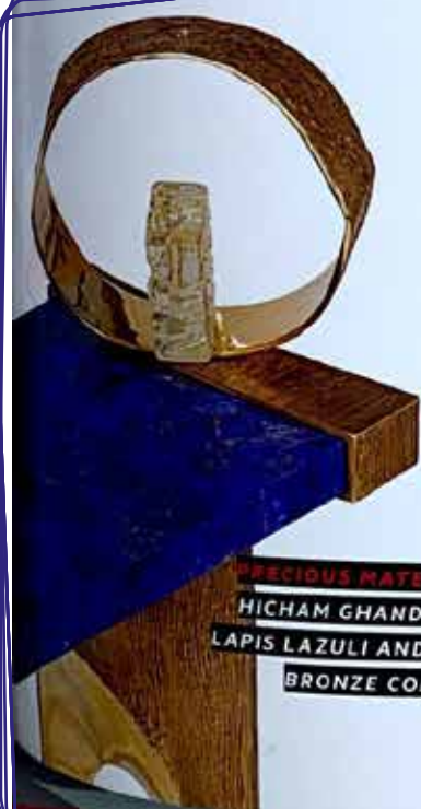
PRECIOUS MATERIALS HICHAM GHANDOUR'S LAPIS LAZULI AND CAST BRONZE CONSOLE